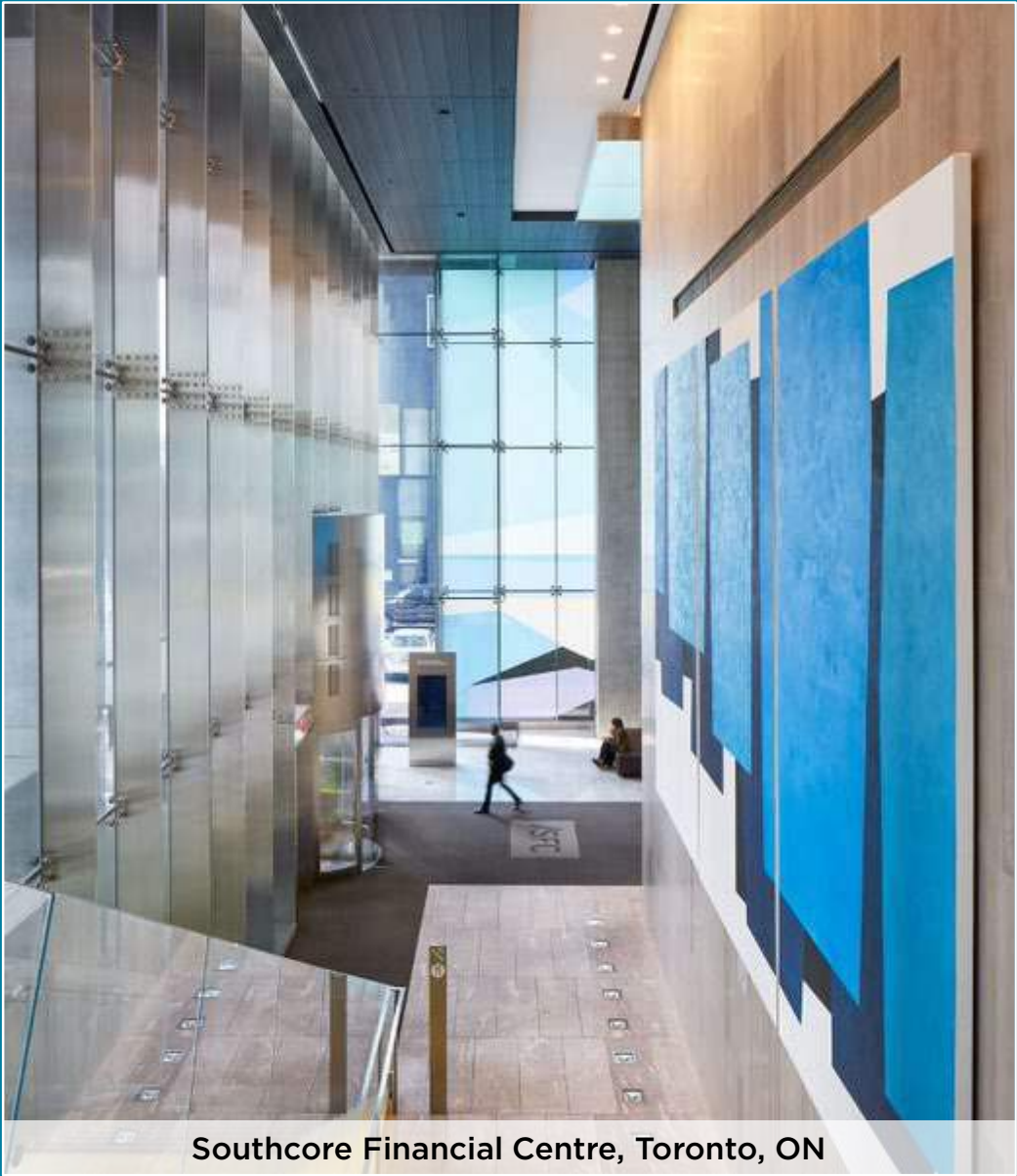
Southcore Financial Centre, Toronto, ON