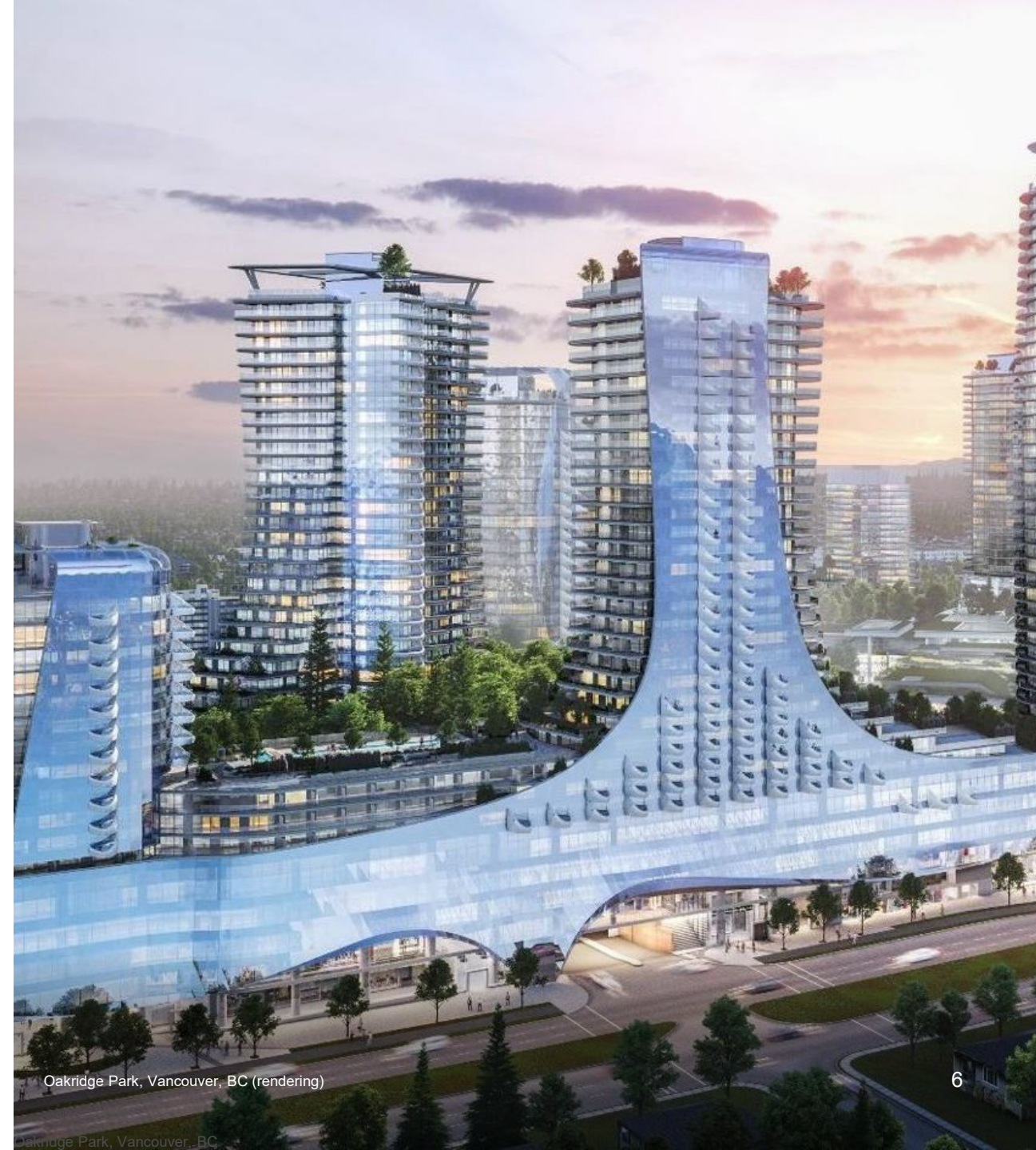
Oakridge Park, Vancouver, BC (rendering)

By 2050, QuadReal aims to reduce its carbon footprint by 80% from 2007 levels