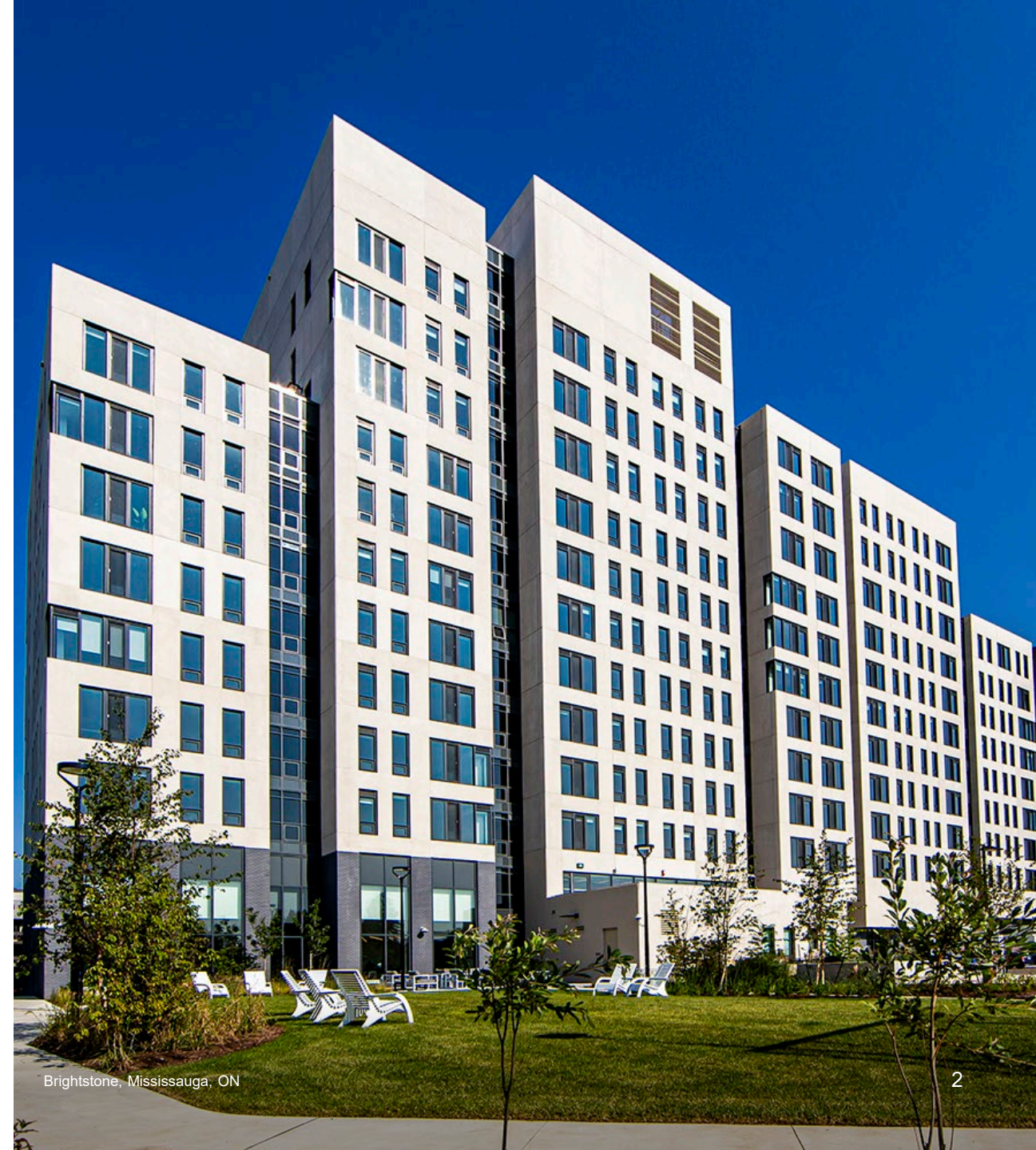
Brightstone, Mississauga, ON

This document may contain forward-looking statements within the meaning of applicable securities laws. Such statements reflect QuadReal Property Group's ("QuadReal") current beliefs and are based on information currently available to us. These statements are not guarantees and are based on estimates and assumptions that are subject to risks and uncertainties. Actual events could differ materially from those projected herein and depend on a number of factors. Accordingly, you should not place undue reliance on forward-looking statements. All forward-looking statements herein are qualified by the foregoing cautionary statements. The forward-looking statements are made only as of the date of this document and we assume no obligation to update or revise them to reflect new information or the occurrence of future events or circumstances, except as otherwise required by applicable securities laws.