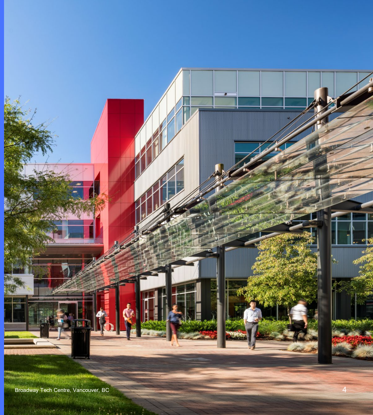
Broadway Tech Centre, Vancouver, BC